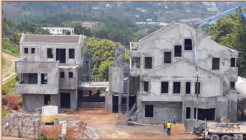
Good progress is being made on the new MOBH dormitory which will hopefully be completed by January 2021

He adds, "We want to take this opportunity to thank all the members and leadership of the Elmslie Memorial United Church for your commitment to the Mount Olivet Boys Home success so far and look forward to your continued support in faith."