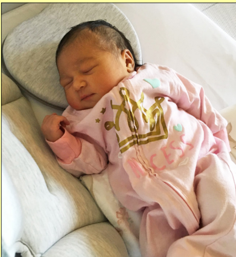
Christmas Morning at Elmslie