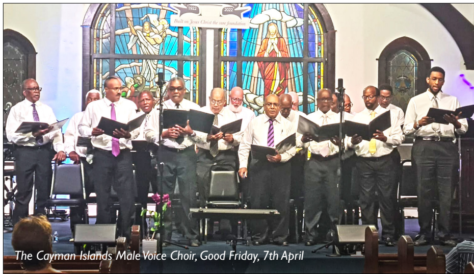
The Cayman Islands Male Voice Choir, Good Friday, 7th April