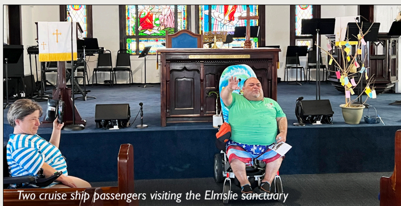
Two cruise ship passengers visiting the Elmslie sanctuary

More help is needed in manning the church when ships are in port, primarily between 11am and 3pm. If there are those who could offer an hour or two, once or twice a week, please contact the office (elmmusic@candw.ky or 949-7923). There is a particular need for volunteers on Mondays.