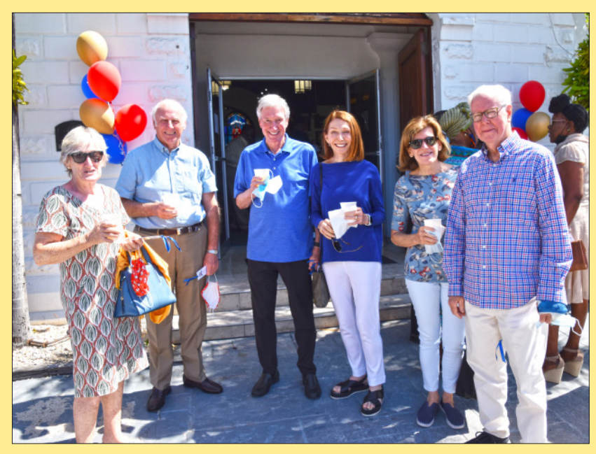
Pictured above, congregants and visitors gather following the Anniversary Celebrations Launch on 6th February.