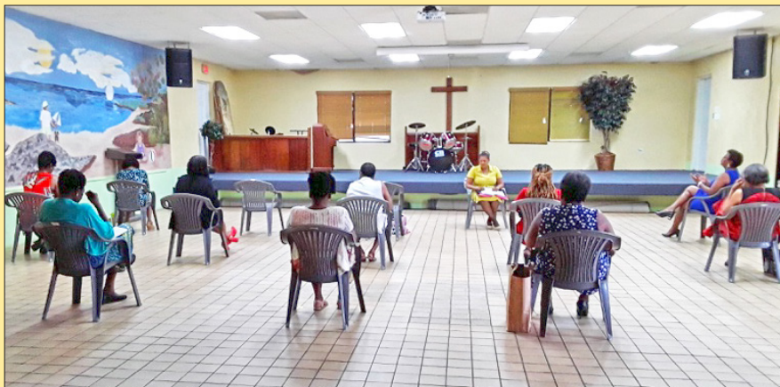
Members of the Women's Fellowship of Elmslie Church gathered in the church hall for the 'Day of Prayer and Fasting' on Sunday, 18th October 2020.