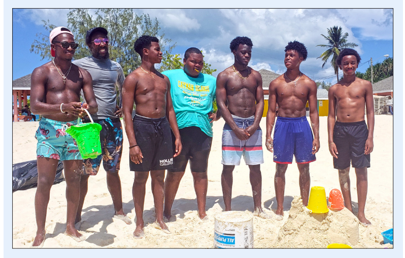
Two Saturday beach picnics were held for our young people, one for children and the other for youth. Above are some of those who attended the latter.